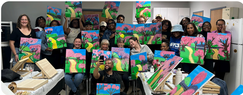
Southern Region DD Management Employee Appreciation Day